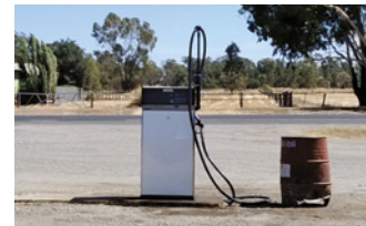
Old drums filled with concrete used as impact protection

Guidance is available in Australian Standard AS 4897 on how to store fuel in underground tanks safely (see Useful resources ).