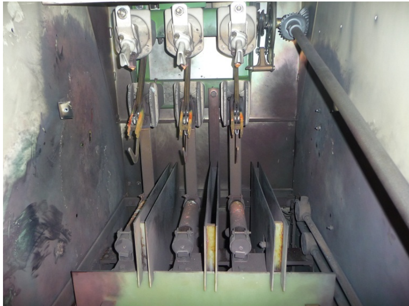
Figure 1 Photograph of the switchgear cabinet showing damage from the arc blast

The first stage of this isolation procedure involved opening the main 6.6 kV isolating switch for the motor. When this isolator was operated, there was a large arc flash and blast, forcing the switchgear cabinet door partially open and damaging the switchgear (Figure 1). The worker operating the isolator received a hand injury and superficial burns.