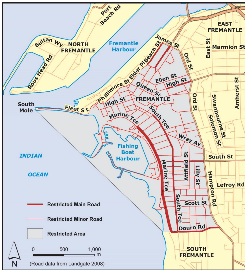
Figure 2 Restricted area boundaries for Fremantle CBD (grey shading, roads shown in red)