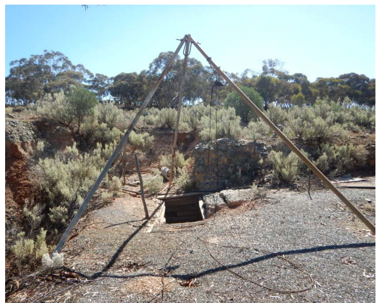
Abandoned Mine Shaft near Coolgardie.