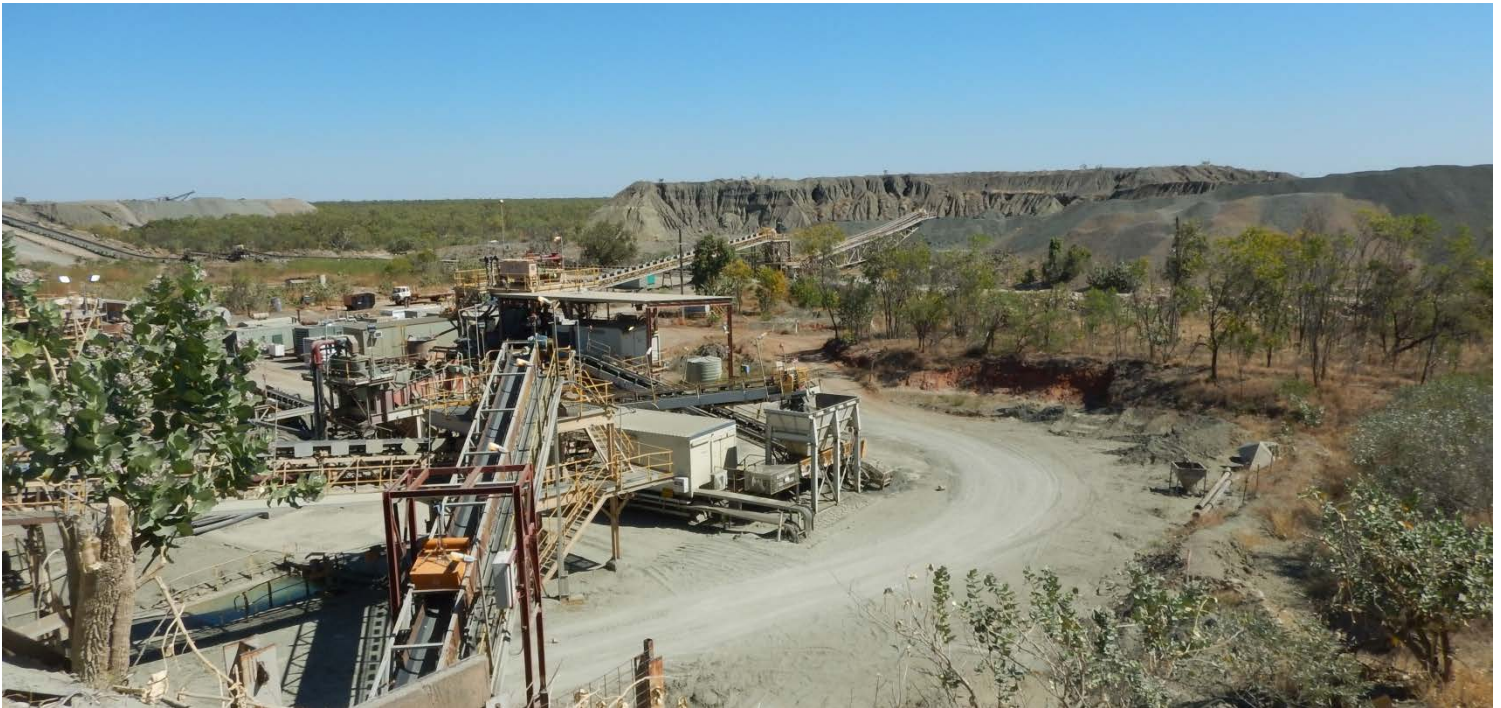
E9 processing plant at the Ellendale abandoned mine site.