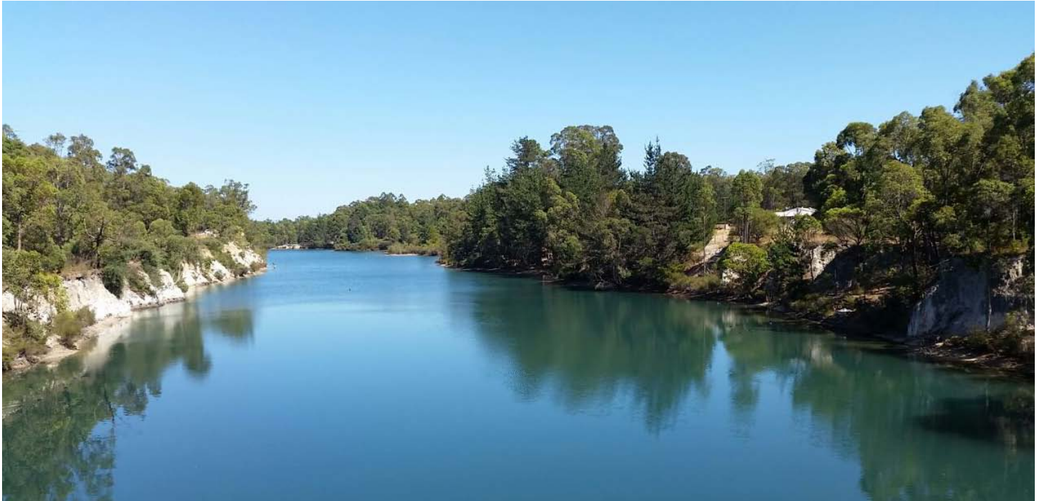
Steep unstable pit wall around Black Diamond Pit Lake.