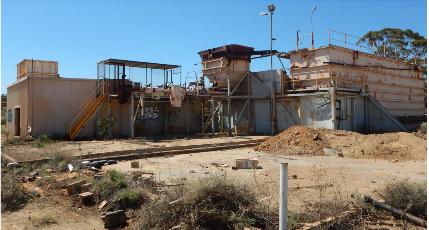
Derelict processing plant at Pro-Force.