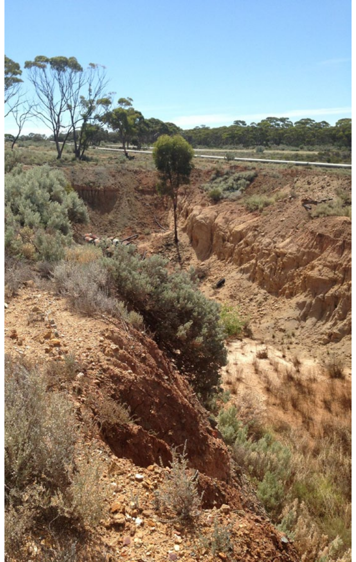
Excavated trench with pipeline and Coolgardie-Esperance Highway in distance.

Stage 3 is due to be completed by the end of April 2017.