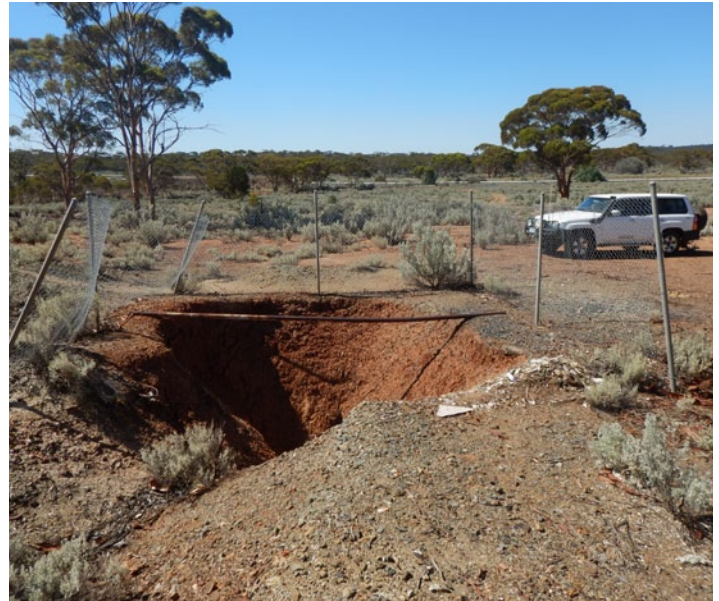
Unsealed shaft.

Stakeholder consultation is detailed in Stage 1 of the project.