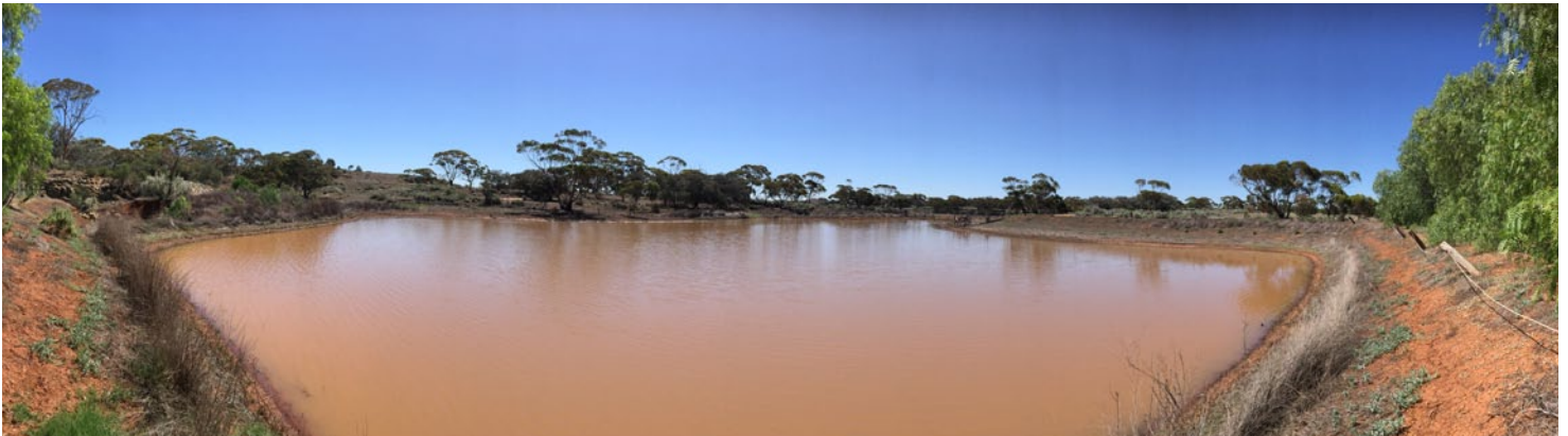
The Gorge after rainfall.