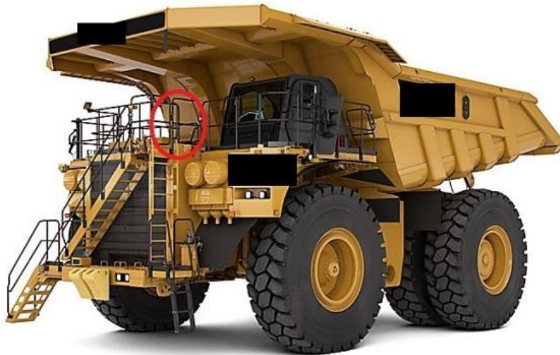
Location of the emergency ladder on a mining haul truck

The truck was in the queue to receive a load when a trainee operator and the trainer stepped out of the cab to hold a discussion. The trainee was leaning over the handrail outside the cab near the emergency ladder when the latch failed. The trainee lost his balance and grabbed the handrail. The trainer reacted immediately and grabbed the trainee's arm to prevent him from falling. The distance to the ground was more than four meters.