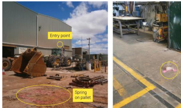
L: Position of spring in storage yard when event occurred, with wall entry point. R: Spring fragment final position on workshop walkway.