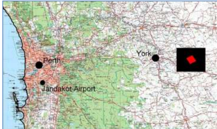
Figure 2. Location map of the low-resolution gravity test area (black) and the inner high-resolution test area (red) in relation to the city of Perth, the township of York, and Jandakot Airport.

The Kauring test range consists of two concentric areas: an inner detailed survey area of about 5 x 6 km centred on the Kauring anomaly shown in Figure 1, with readings made at points that varied between 50 m and 250 m apart; and an outer area of 20 x 20 km surveyed in less detail with gravity measurement points 500 m apart that can be used for lower resolution airborne systems (Fig. 2). The regional survey consisted of reading points 2 km apart and provides a 'gravity context' for measurements in the test range areas.