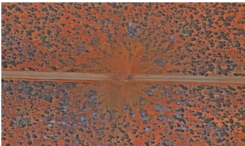
Drone image capturing aftermath of explosion.

At 11:33 am, the tanker exploded. The explosion caused several spot fires around the site. No one was injured.