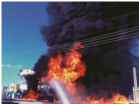
Maddington fuel tanker fire in 2009

Note: An example of what can happen when a fire extinguisher is not used during the early stages of a fire is illustrated by the Maddington fuel tanker fire. “On Friday 15 May 2009, a fuel tanker was unloading petrol into underground tanks at a suburban service station when a fire started at the fill point. During the early stages of the fire, the tanker driver did not use the fire extinguishers installed on the tanker nor those available at the petrol station. The fire spread from the fill point to the tanker. Use of the available fire extinguishers may have prevented the tanker from catching fire.”