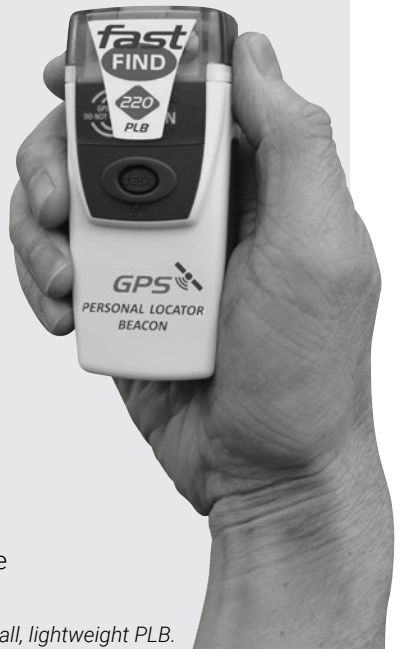
An example of a small, lightweight PLB.

The PLB is a small device that, when activated, transmits a message via satellite to emergency services. Coordinates transmitted by the PLB are used by rescuers to pinpoint its location.