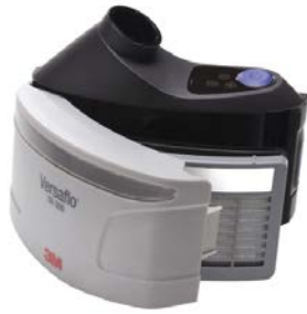
3M™ Versaflo™ Powered Air Purifying Respirator, TR-300