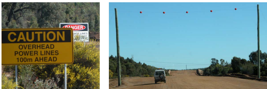
Figure 2 Examples of warning signage (left) and clearance indicator (right) on approach to high-voltage overhead powerlines on a mining operation