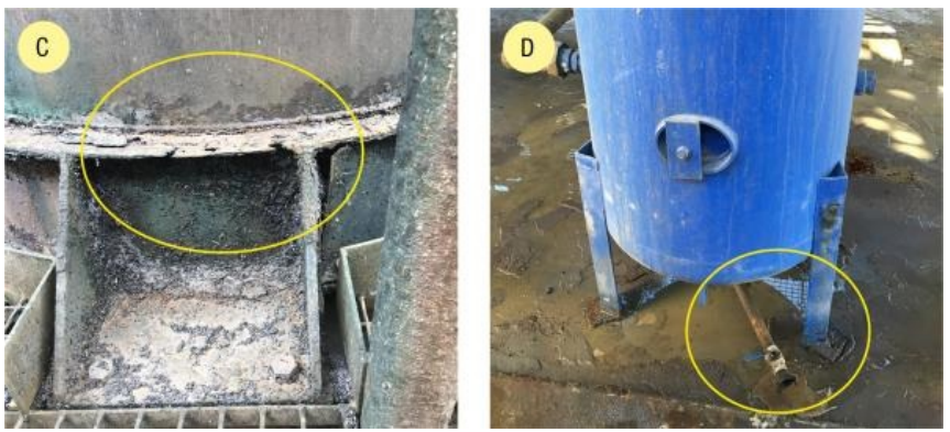
Pressure vessel supports. A. Unanchored vessel containing refrigerated argon gas. B. Air receiver leg anchored to grating only. C. Severe corrosion of a support bracket to an acid elution column (condition of shell unknown). D. Air receiver not bolted down and connection point corroding.