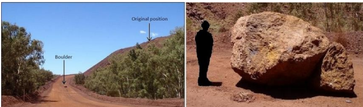
Photographs showing boulder's original and final positions; and size of boulder