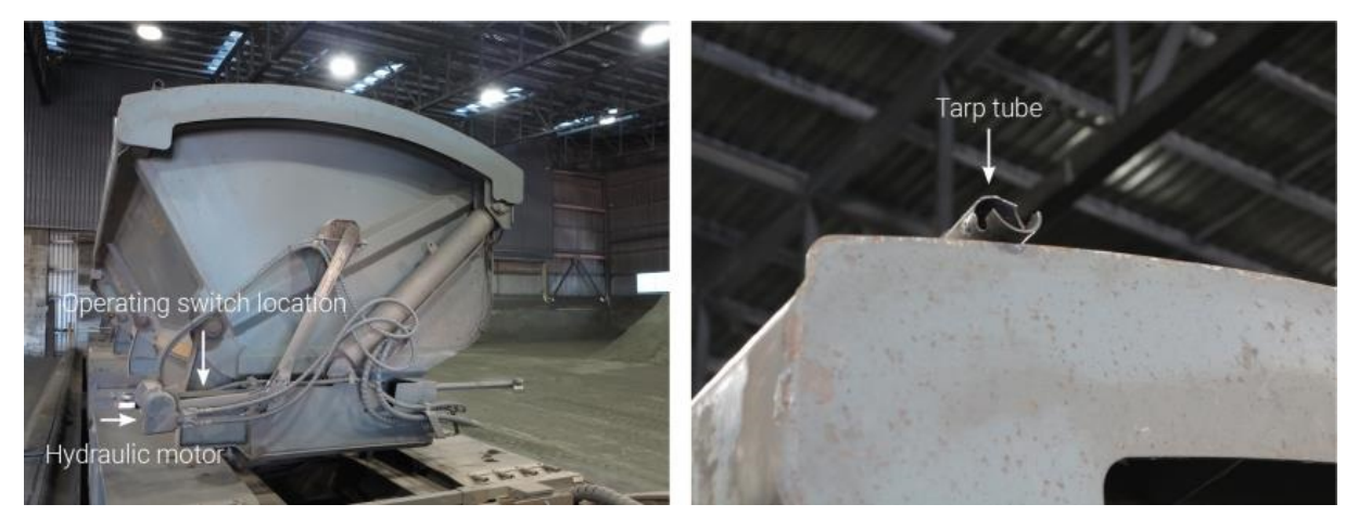
L. Detached motor and swing arm from the tarp tube. R. Fractured end of tarp tube where motor and swing arm attach on tarpaulin covering system