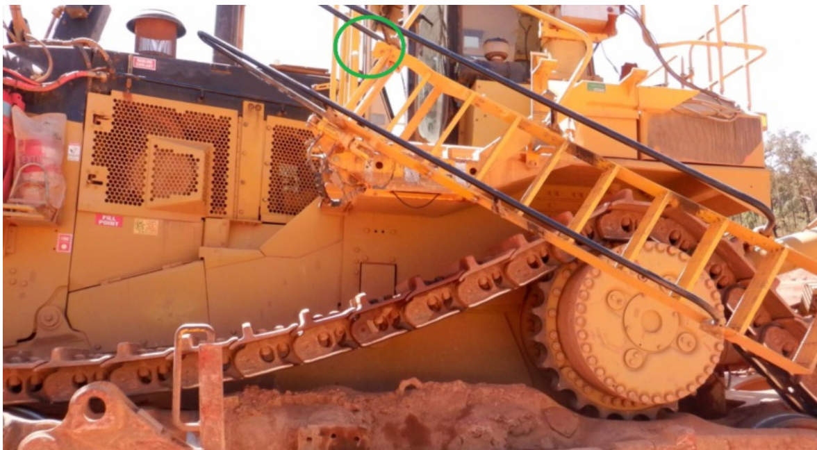
The circle indicates where the accident happened, with the staircase in a partially raised position.

The leading hand saw that the operator was trapped and used a spanner to remove the handrail from the bulldozer and free the operator prior to site emergency response personnel arriving and providing assistance. The operator was airlifted to hospital for treatment of crush injuries to their leg.