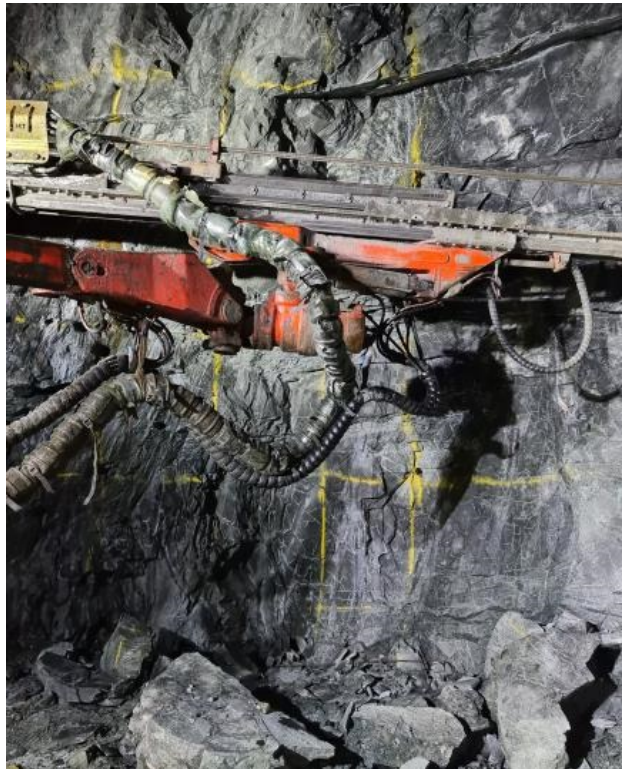
View of the face from the bottom pillar. Note the geological structures on the face and large rock that struck the two workers.

The rock dislodged from the bored face, from a geological structure, striking the two workers approaching the face to install lifter tubes.