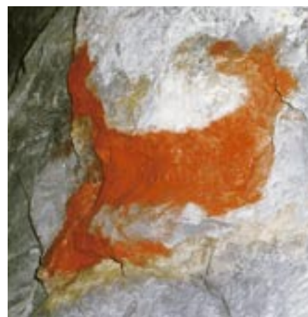
A small, isolated occurrence of actinolite asbestos is sealed in situ by the use of epoxy-based paint.

When contaminant asbestos is encountered in the course of mining operations, then the MSIR references